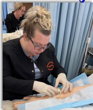
I.V. Insertion Lab